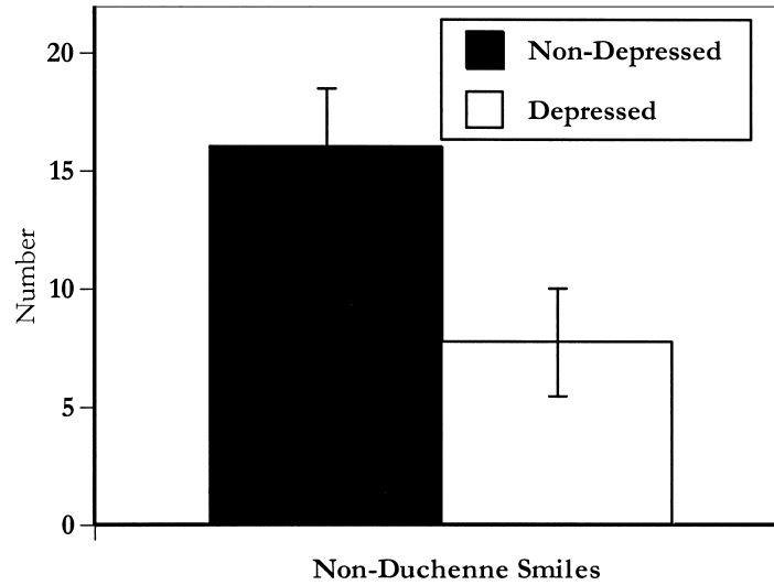
Figure 2. Mean and standard errors for non-Duchenne smiles (in numbers) for nondepressed ( n = 10 ) and depressed ( n = 12 ) Latinas during the amusing-human film clip. p = .025 .